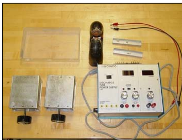
Fig. 1 Breakdown of Equipment